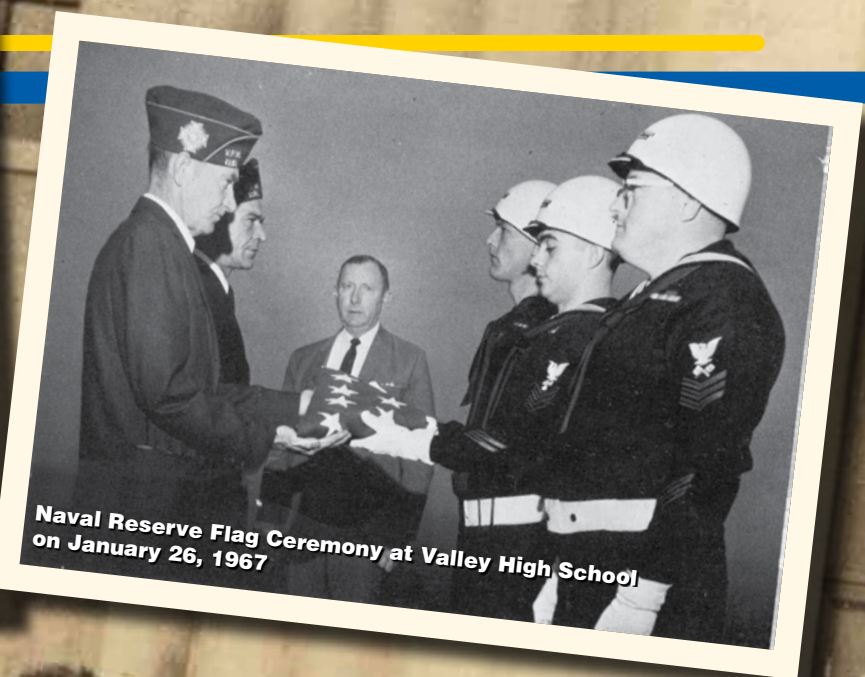
Naval Reserve Flag Ceremony at Valley High School on January 26, 1967