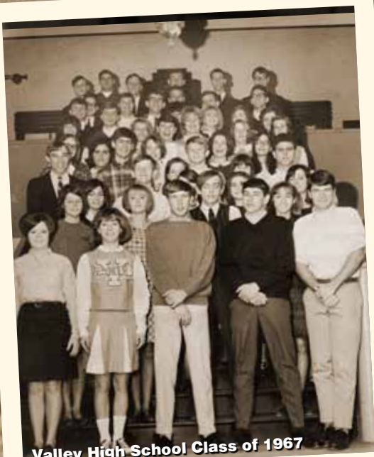
Valley High School Class of 1967