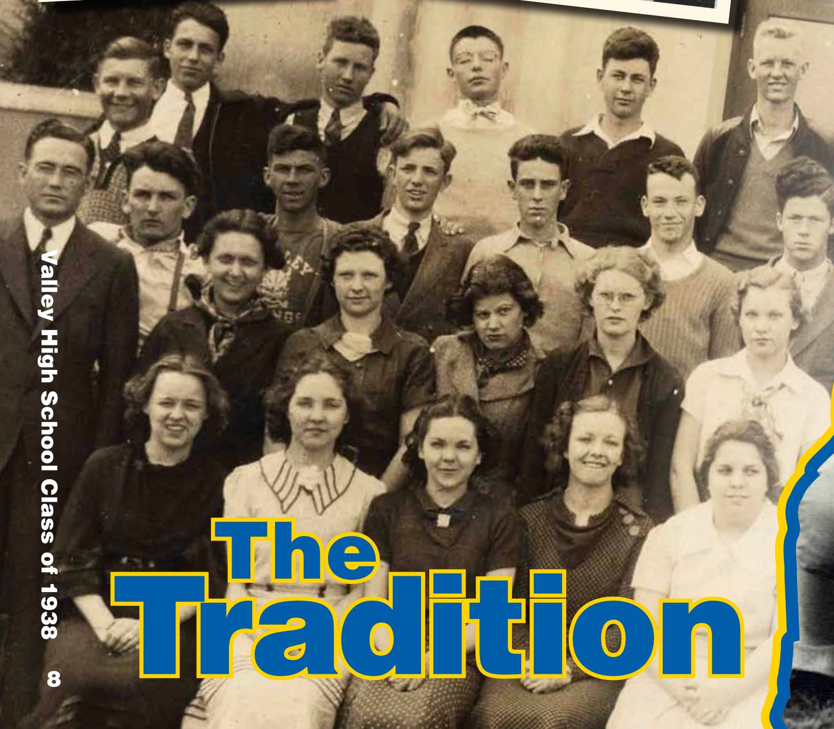
Valley High School Class of 1938