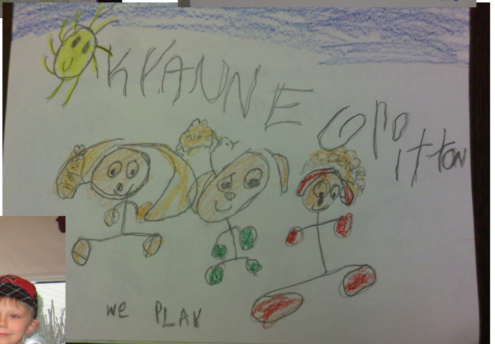
Top Left-Kindergartener Alexis Young draws a picture of playing and summer fun Top Right-RIF campaign (Reading is Fundamental) Middle-Picture by kindergartener Kyanne Gritton Bottom Right-Kindergartener picture Bottom Left-Rock n Read